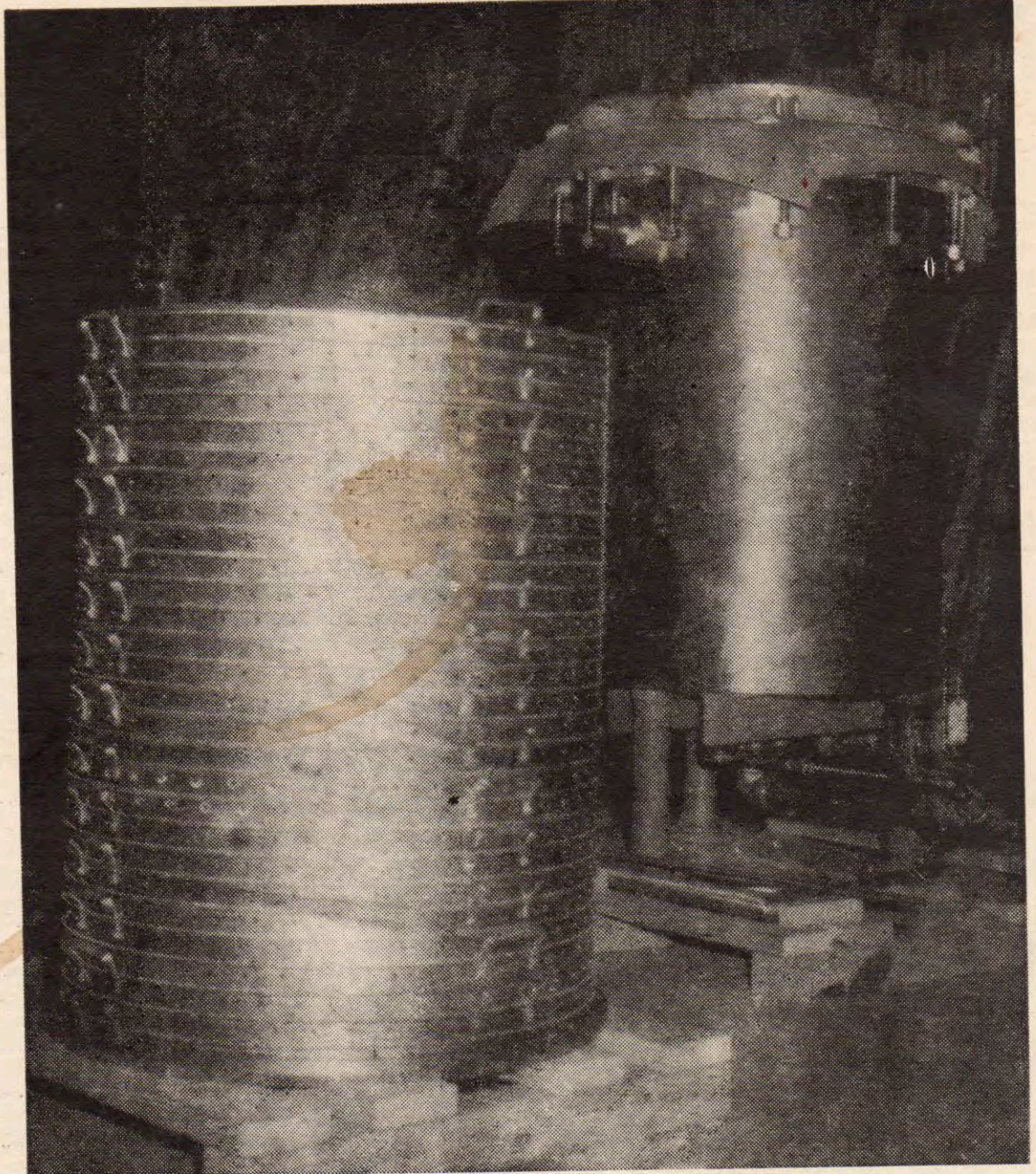
MODEL 33-S-28 HORIZONTAL PLATE WHISKEY FILTER

This filter, purchased by the Continental Distilling Corporation, is one of many such units which have been designed specifically for the final filtration (polish) of whiskey prior to bottling. Breweries and distilleries take particular pride in the experience of the equipment they